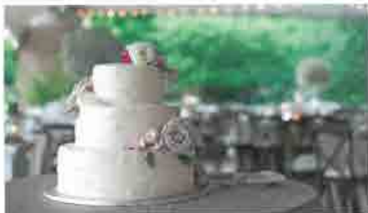
Clockwise from top: The newlyweds share a sweet moment together at the Chicago Botanic Garden; the flower girl (the couple's niece) wore a baby's-breath crown in her hair; Deerfields Bakery created the couple's garden-inspired, three-tiered wedding cake.

What We Learned "Try to be patient, flexible and as open-minded as you can. When it's time for the wedding, you'll be able to enjoy the special moments and just have fun!" says the couple.