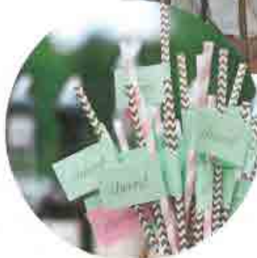
From above: A neutral color scheme of peach, blush and champagne unified the decor, and sweet accents, such as the "Mr and Mrs" bunting on the back of the bride and groom's bistro chairs were a hit; straws at cocktail hour sported flags that said "cheers!"