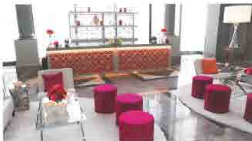
From above: Customized cocktail napkins with the wedding date and a sketch of the Chicago skyline by Cloud Nine; HMR Designs created a bar and lounge area using white furniture as the backdrop and the couple's main colors as accent pieces.

Something Old: Matt's baptismal bonnet sewn into Alison's dress