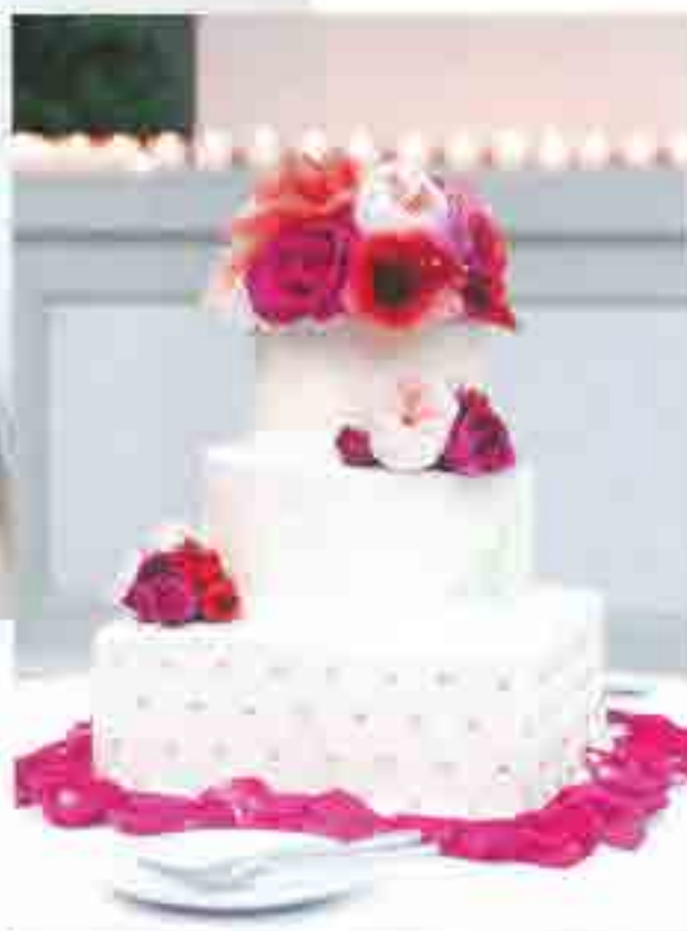
Clockwise from above: The bride wore a two-piece Monique Lhuillier gown with an embellished corset, while the groom opted for a classic tux by Tommy Hilfiger; the wedding cake, and a variety of cupcakes on the dessert table, were made by the bride's favorite bakery, Sweet Mandy B's; colorful floral arrangements of lilies, roses and hydrangeas in varying heights topped the tables.