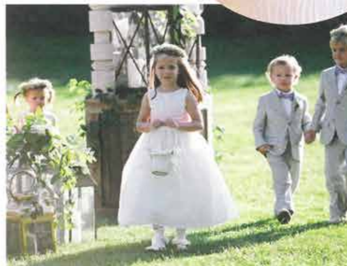
From above: Elysia Root Cakes created a textural chocolate-and-vanilla cake with fresh blooms; the couple's adorable nieces and nephews charmed as flower girls and ring bearers, donning flower crowns and miniature Ralph Lauren suits.