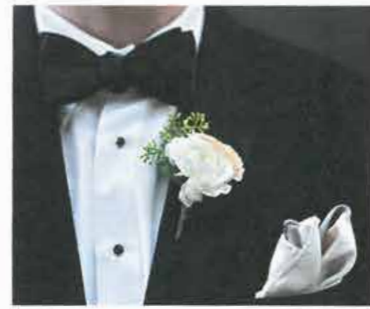
Clockwise from above: HMR Designs combined lush florals in shades of pink with vibrant greenery to create the bride's fresh bouquet; Connor looked dapper in a Vera Wang tuxedo with coordinating gray-and-blush pocket square; the room glowed with towering crystal votives and fluffy arrangements of baby's breath.