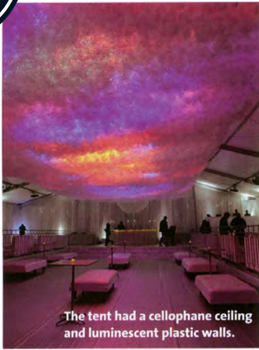
The tent had a cellophane ceiling and luminescent plastic walls.