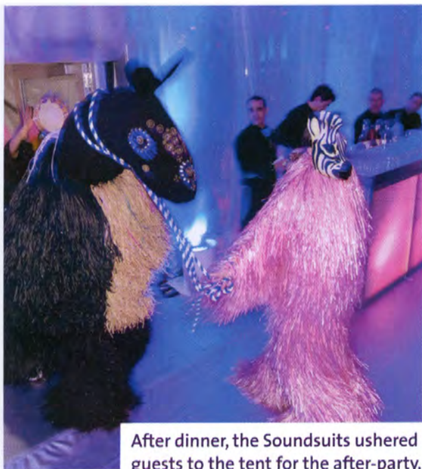
After dinner, the Soundsuits ushered guests to the tent for the after-party.

As the band played, passed treats included push-up coconut cream pie. Tiered dessert stands held Southern-inspired cakes, and an old-fashioned jerk soda station doled out root beer floats. In the lounge areas, guests found bottles of Svedka vodka, shot glasses, and grab-and-go funk concert attire: sparkly gold and silver bow-ties. —Jenny Berg