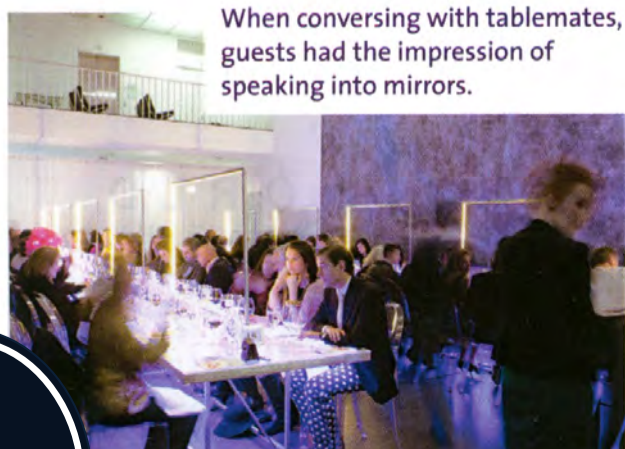
When conversing with tablemates, guests had the impression of speaking into mirrors.